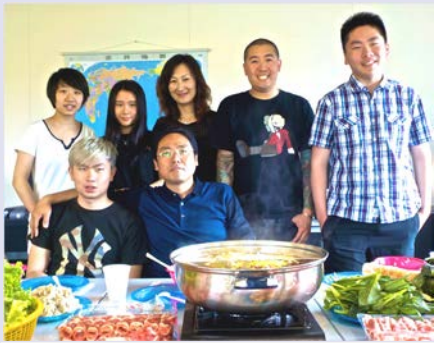
Intermediate Class having a hot pot lunch party