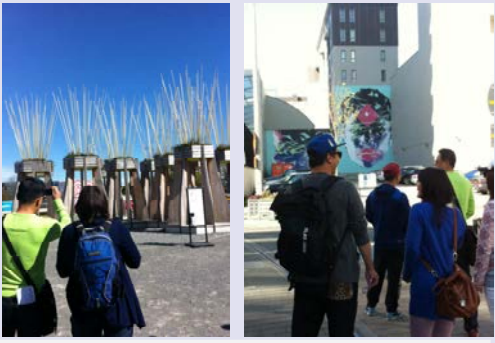
Elementary Class visiting the city art trail