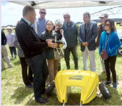
English for Migrant Class Visiting Lincoln University Dairy Farm